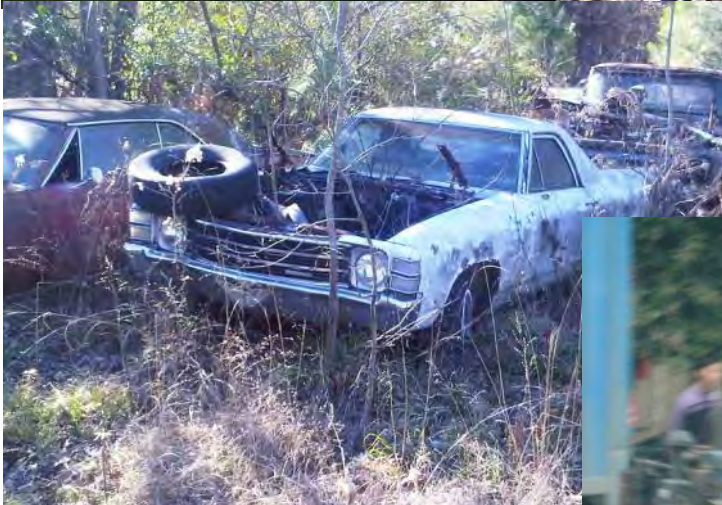
The Jackson Bone Yard in Texas