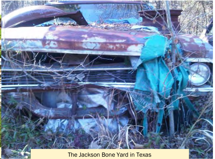
The Jackson Bone Yard in Texas