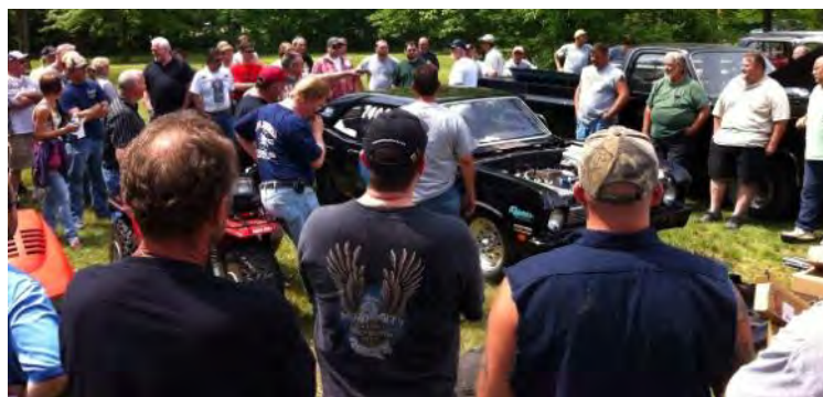
This 9 sec Nova Race Car sold for $6300

storing engine blocks and transmissions. I already have a few engines and transmissions laying around. I haven't made my mind up on who gets the toys so its time to "Burn Rubber" to my lawyers office.