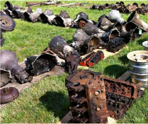
The Rahl Auction in Vermillion