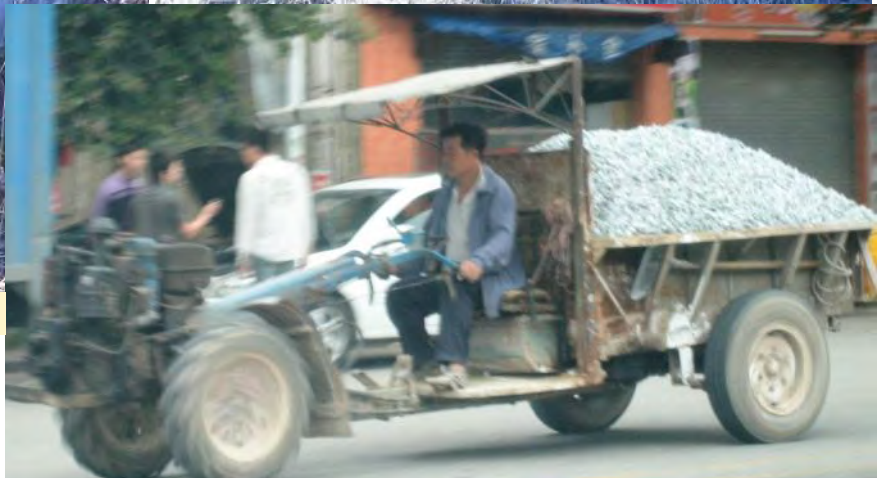
My trip to China