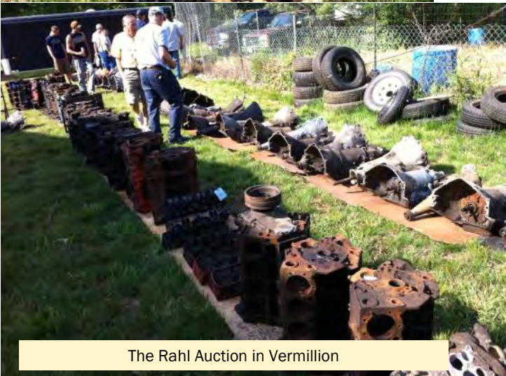
The Rahl Auction in Vermillion